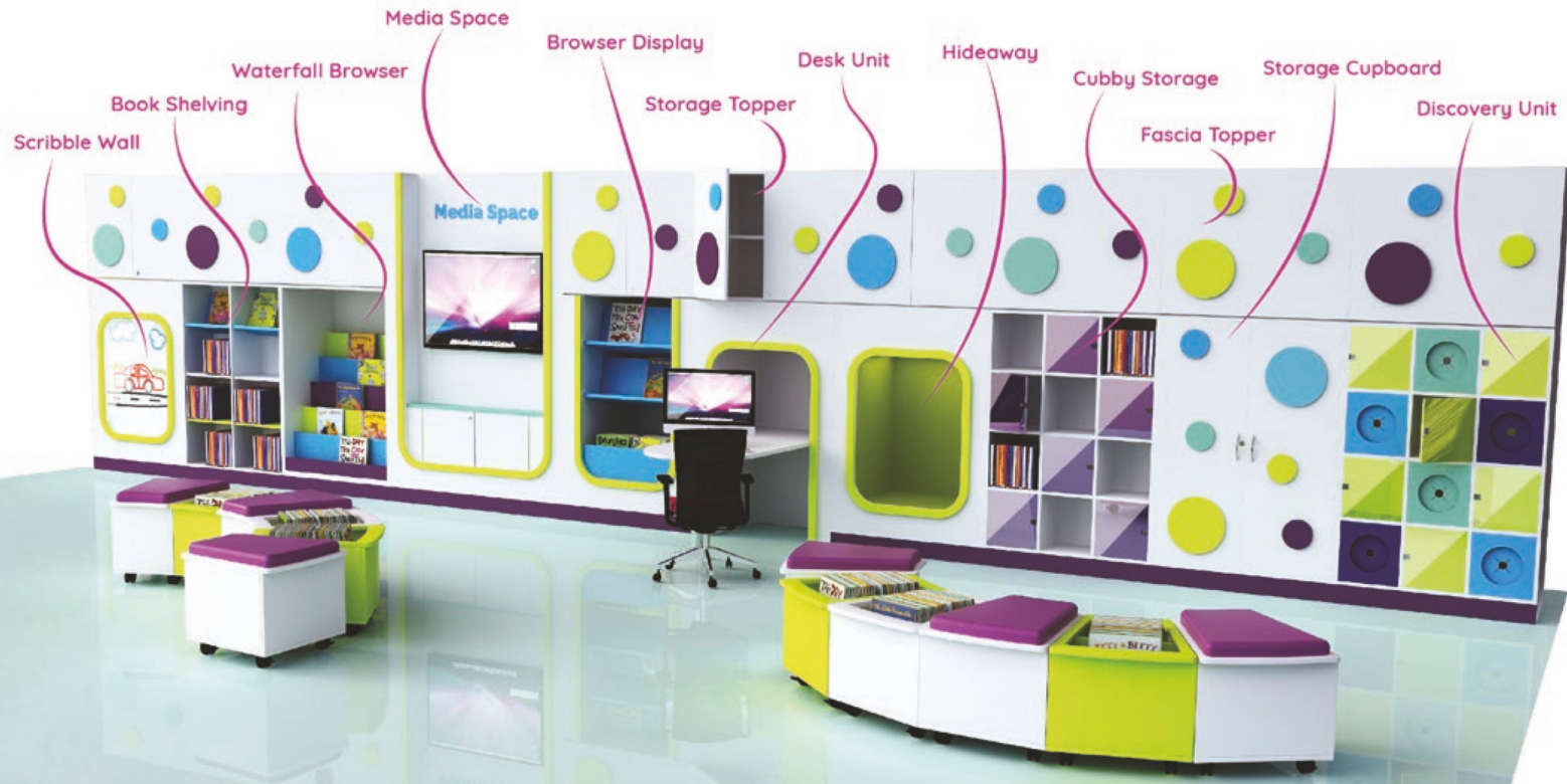
Shown with Bookwork Kinderbox Browser and Seats